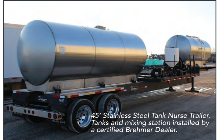
45' Stainless Steel Tank Nurse Trailer. Tanks and mixing station installed by a certified Brehmer Dealer.