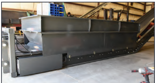
Optional hopper skirting