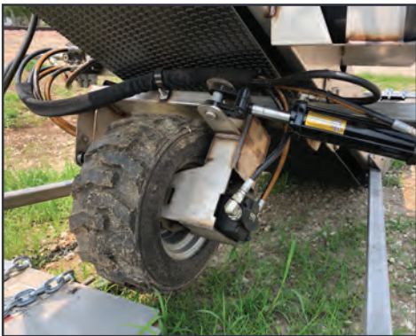
Hydraulic driven and steerable drive wheel

Featuring 304 stainless steel undercarriage and framework, this field loader boasts a drive wheel with power steering.