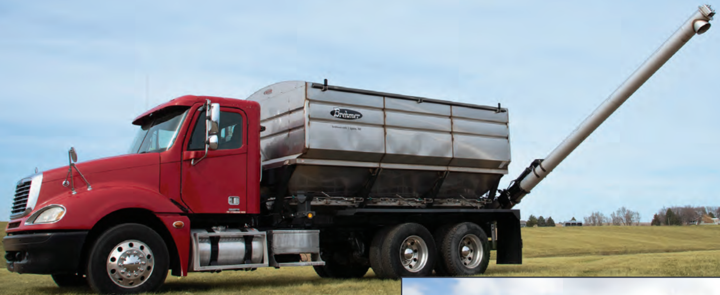
15' Side Discharge Truck Mount