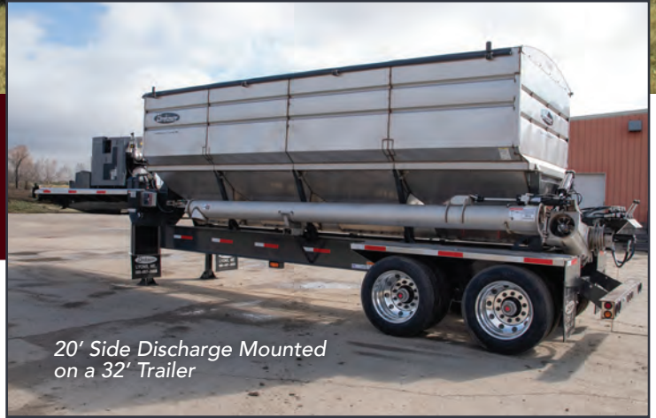
20' Side Discharge Mounted on a 32' Trailer