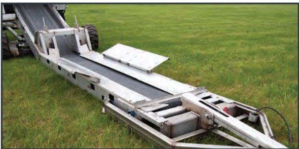
Don't need a full lime hopper? Order the FLX1224 standard fertilizer package.