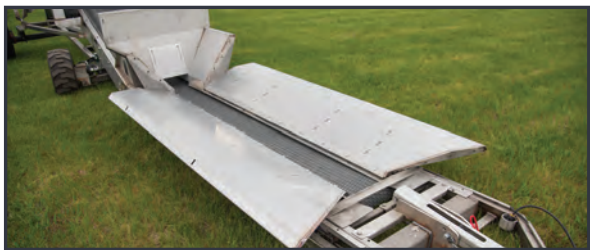
The lime hopper converts for low profile loading for fertilizer.

Transition between fertilizer and lime with the dual purpose FLX1224 Field Loader from Brehmer Mfg. The lime hopper easily disassembles and converts for low-profile loading of fertilizer.