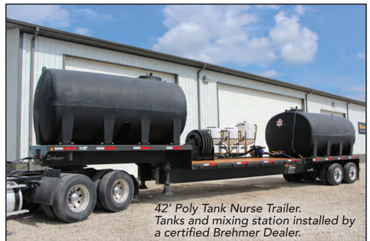
42' Poly Tank Nurse Trailer. Tanks and mixing station installed by a certified Brehmer Dealer.