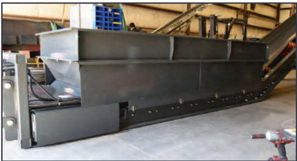
Optional hopper skirting