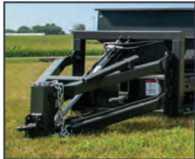
Remote controlled belt and tow hitch.