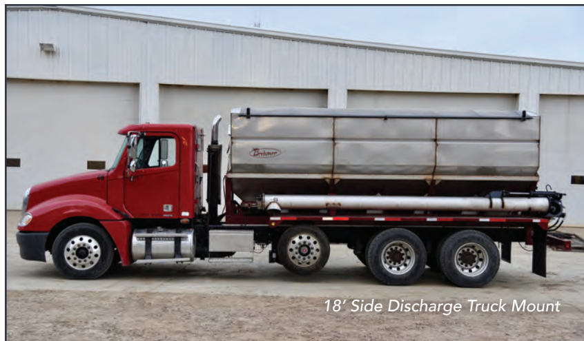
18' Side Discharge Truck Mount