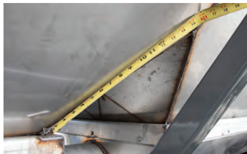
Shallower hoppers eliminate need for vibrators