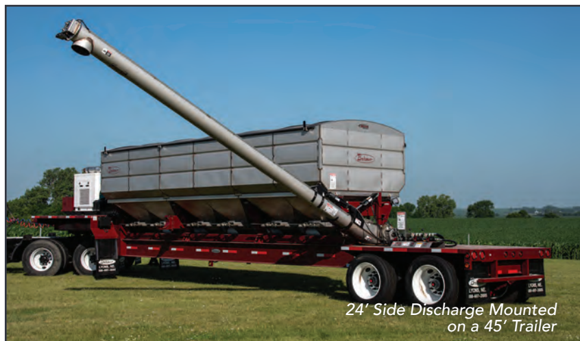
24' Side Discharge Mounted on a 45' Trailer