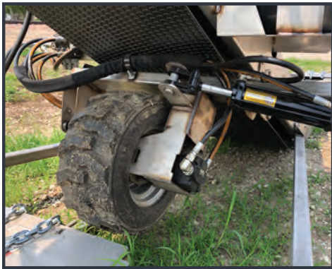
Hydraulic driven and steerable drive wheel

Featuring 304 stainless steel undercarriage and framework, this field loader boasts a drive wheel with power steering.