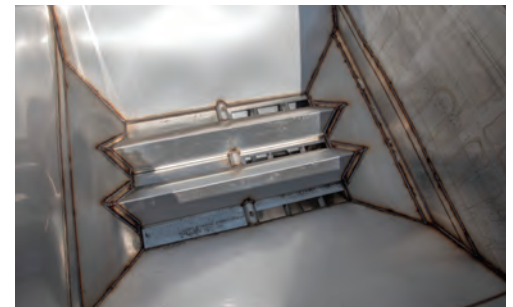
New bin design increases capacity